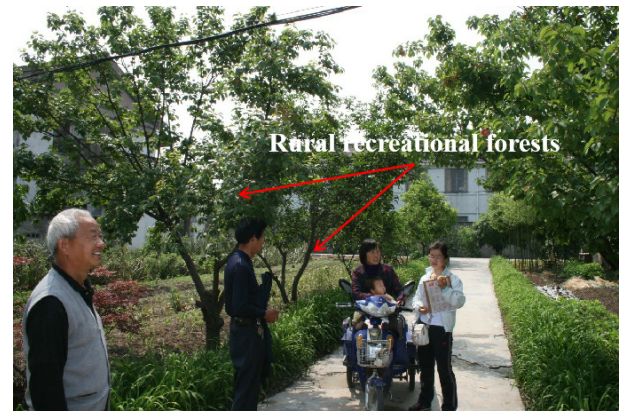
Fig. 9 Rural recreational forest (for landscape and recreation) is a new and thriving type of residential forest associated with rural development [21] .

The configuration of tree species in rural human settlement forests is based on the principles of ecological adaptation, functional optimization, biodiversity, and landscape richness. Specifically, the different configuration options can be categorized as follows: