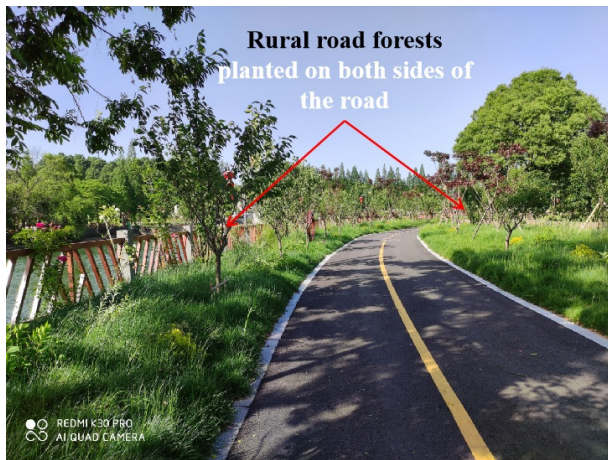
Fig. 6 Rural road forests (to purify air and provide shade, shelter, and moderate temperature) have numerous roles, and are typically listed in local regional development plans.