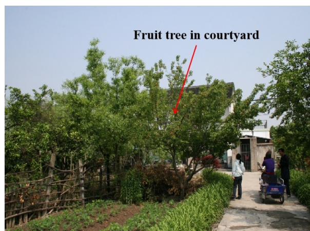
Fig. 5 Rural courtyard forests (planted in the courtyard to produce fruit and provide shelter, photographed by Jianfeng Zhang) have a long tradition and are preferred and promoted in the country [21] .

(iv) Rural surrounding village forests (Fig. 8). These forests are established in plain areas, utilizing unused land adjacent to villages for tree planting. They protect the wind and stabilize sand, provide recreation places for residents, and produce forests that have ecological, economic, and social functions. Deep-rooted species