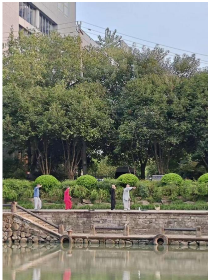
Fig. 1 Residents and human settlement forests, which is a booming style of living.

and ecological functions [14] . Practical knowledge relating to planting methods, such as the configuration of tree species, stock spacing, site preparation, and seedling treatment in situ , remains lacking, which is important for the development of rural human settlement forests.