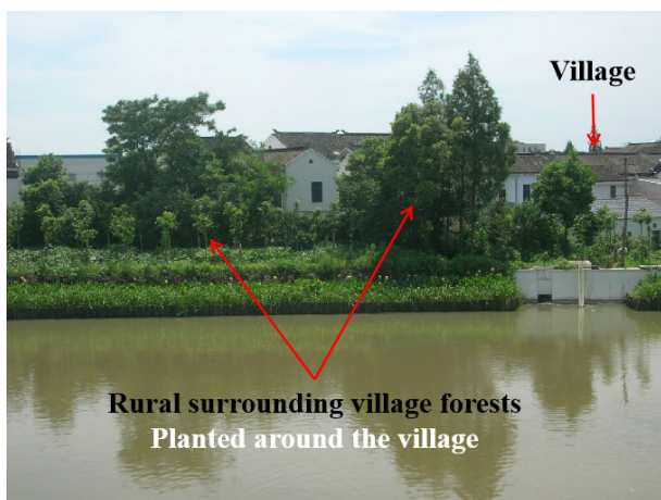
Fig. 8 Rural surrounding village forests (for shelter and aesthetics, photographed by Jianfeng Zhang) are the traditional human settlement forest type [21] .