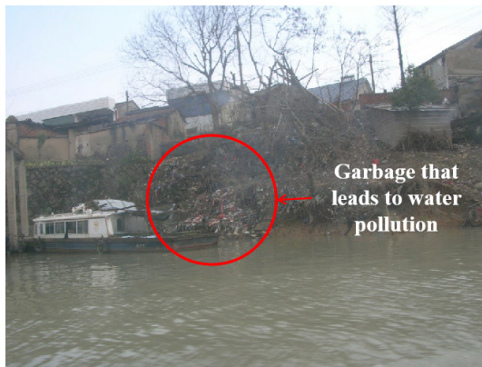
Fig. 2 Random disposal of garbage can result in the decline of surface water and groundwater quality in some rural areas. This situation is relatively common and requires management [21] .

such as fertilization, can promote the occurrence of non-point source pollution.