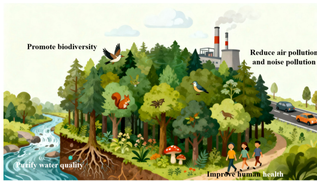
Fig. 4 Ecological functions of human settlement forests (created by Rongjia Wang using AI and PPT. Some of the materials are sourced from the Internet and are only used for illustration and not for commercial profit).

stands were lower than those in the control plot (wasteland). The TN (TP) losses in Q. acutissima and R. pseudoacacia were 62.84% (44.84%) and 57.76% (34.86%) in the control (wasteland), respectively. In addition, de Oliveira et al. [44] and Zhang et al. [45] identified farmland as a source of non-point source pollution, while forests alleviated non-point source pollution. These studies indicate that forests can reduce runoff pollution, thereby improving water quality.