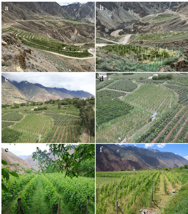
Fig. 2 Xizang vineyards. (a), (b) Ranba village vineyard in Zhayu Town, Zogong County; (c)–(f) Dameiyong vineyard in Naxi Town, Markam County.

Salta (3,111 m), by approximately 500 m [39] . Furthermore, the novel early-ripening wine grape cultivar Yunniang No. 3, developed by the Chuxiong Academy of Agricultural Sciences, exhibits resistance to downy mildew and powdery mildew and moderate resistance to gray mold and white rot. Consequently, this cultivar is suitable for high-altitude cultivation in Xizang and Yunnan under conditions of annual precipitation \leq 700 mm [40] .