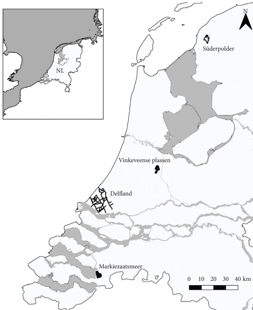
FIGURE 1: Map of the study area in the Netherlands and the four water systems (black), from north to south: Süderpolder, Vinkeveense plassen, Delfland and Markiezaatsmeer.