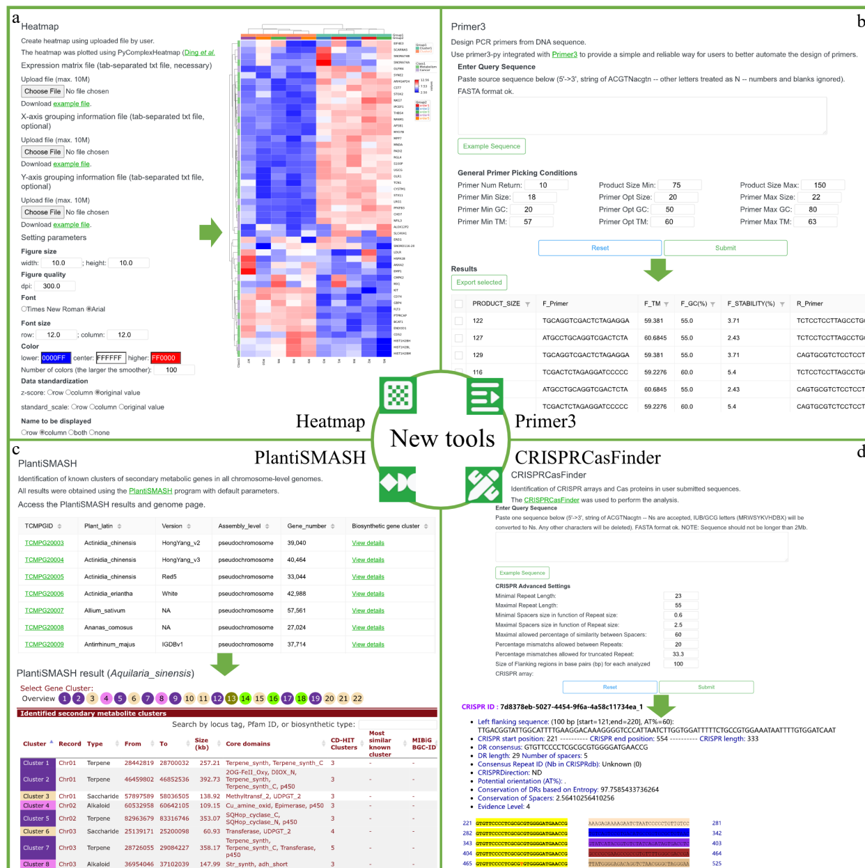
Fig. 3 The newly added tools in TCMPG 2.0.

community. It not only offers a wealth of information but also provides enhanced services, fostering a more in-depth exploration of traditional Chinese medicine. This platform is poised to play a pivotal role in advancing our understanding of traditional Chinese medicine in the context of modern research.