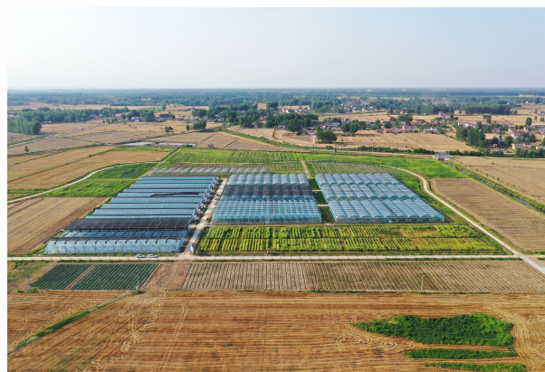
Fig. 1 Celery germplasm resource nursery in Suqian Research Institute of Nanjing Agricultural University (Facility Horticulture Research Institute of Suqian), Nanjing, China.

It is important that celery scientific research is oriented towards production and in line with the celery industry. Researchers need to pay more attention to the development of celery industry and layout in advance, to provide help for celery genetic breeding through scientific research and innovation. At present, a celery germplasm resource nursery with a wide range of cultivars has been established in Suqian, Jiangsu Province by Suqian Research Institute of Nanjing Agricultural University (Fig. 1). In the future, scientific research institutions will speed up the creation of celery germplasm resources, strengthen the mining, protection, and utilization of celery excellent breeding materials, carry out the improvement and creation of celery breeding materials, and form the diversification, pluralism and differentiation of celery breeding characteristics. Scientific research work should be guided by market demand, focusing on the shortcomings in celery production, green and healthy food and simplified cultivation technology, and integrating enterprises for production service. Researchers need to make extensive use of the new technology of modern