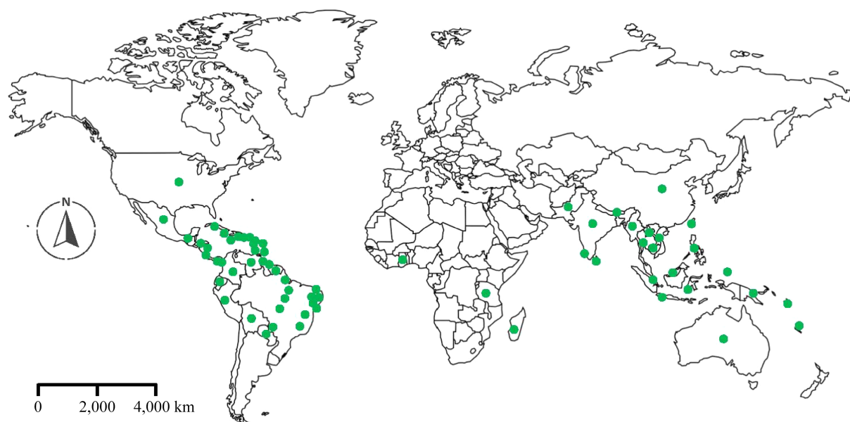
Fig. 1 Worldwide distribution of A. muricata . Source: adapted from Datiles & Acevedo-Rodriguez [12] .

potential rootstock to other commercial Annona species due to its relative tolerance to flooding conditions [15] . Therefore, sustainable plantation management techniques and agronomic practices are vital tools to favor crop growth and optimal production, under suitable/optimal environmental conditions. One of the environmental components that deserves particular attention vis-à-vis management for optimal crop production is the soil. A paucity of information exists on the pedological requirements of A. muricata . Based on a synthesis of published works on the environmental factors influencing soursop growth, the main objective of this work is to identify and establish baseline climatic and soil conditions most suitable for its growth. This information will be helpful in narrowing the knowledge gap for plantation intensification where farm inputs (such as chemical fertilizers and pesticides) and irrigation programs are indispensable for optimizing yields.