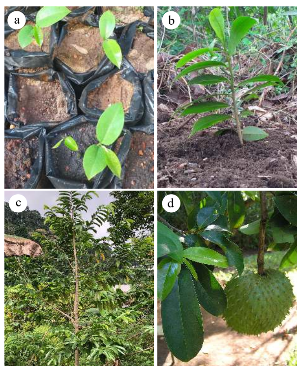
Fig. 2 (a) One-month old soursop seedlings, (b) 6-month old seedlings transplanted on a Eutric Silandic Andosol (Loamic) in a humid tropical forest environment with mean annual rainfall of about 3,100 mm, mean annual temperature of 25.2 °C, and mean annual relative humidity of > 85%, (c) 28-month old soursop tree and (d) a mature soursop fruit.

In terms of medicinal potentials, plant parts of A. muricata have been shown to have antidiabetic effects [19] , antihemolytic effects [20] , antiproliferative and anticancer effects [21–25] antioxidant effects [20,23,26–28] , anti-inflammatory effects [23,24,28] , antibacterial effects [23,27,29,30] , molluscidal [31] , insecticidal [32] and antiviral effects [20] . Extensive reviews on the traditional/medicinal use and biological activities of A. muricata have been made [33–37] .